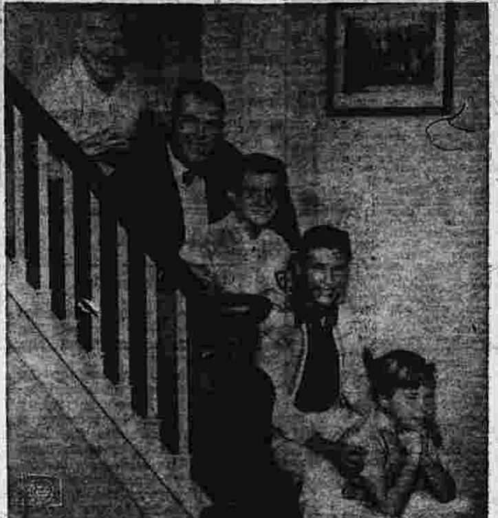
Wooed by TV for 10 years, Fred MacMurray finally breaks down and acquires a home screen family in "My Three Sons." From top of stairs: "Grandpa" William Frawley; "widower" MacMurray; "sons" Tim Considine, 20; Don Grady, 16; Stanley Livingston, 9.